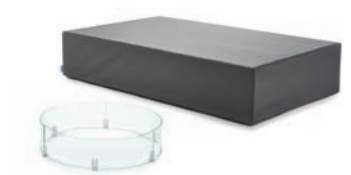
Screens & Covers