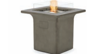
Strata *Shown with optional glass screen